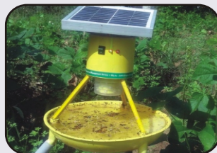
Solar light trap