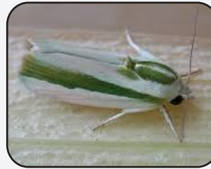
Okra fruit borer