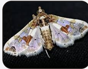
Brinjal fruit borer