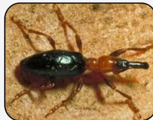
Sweet potato weevil