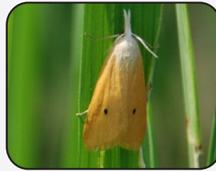
Rice yellow stem borer